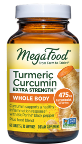
MegaFood Turmeric Curcumin Extra Strength Whole Body