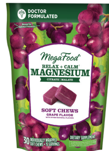
MegaFood Relax + Calm Magnesium Soft Chews