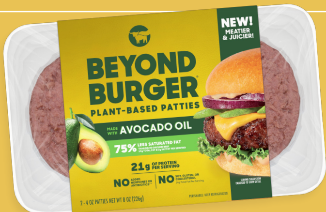
Beyond Meat Beyond Burger 8 oz