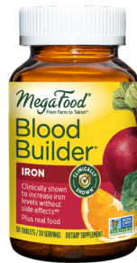
MegaFood Blood Builder

MegaFood is a certified B Corporation and proud member of 1% For the Planet. We believe that nature and science work best together. That's why we are dedicated to crafting plant-powered supplements that nurture the health of people and our planet.