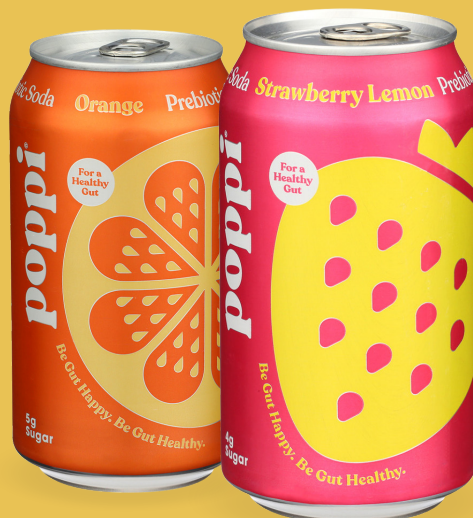
Poppi Prebiotic Soda selected varieties